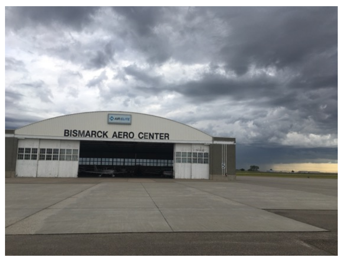
Morning at the FBO in Bismarck