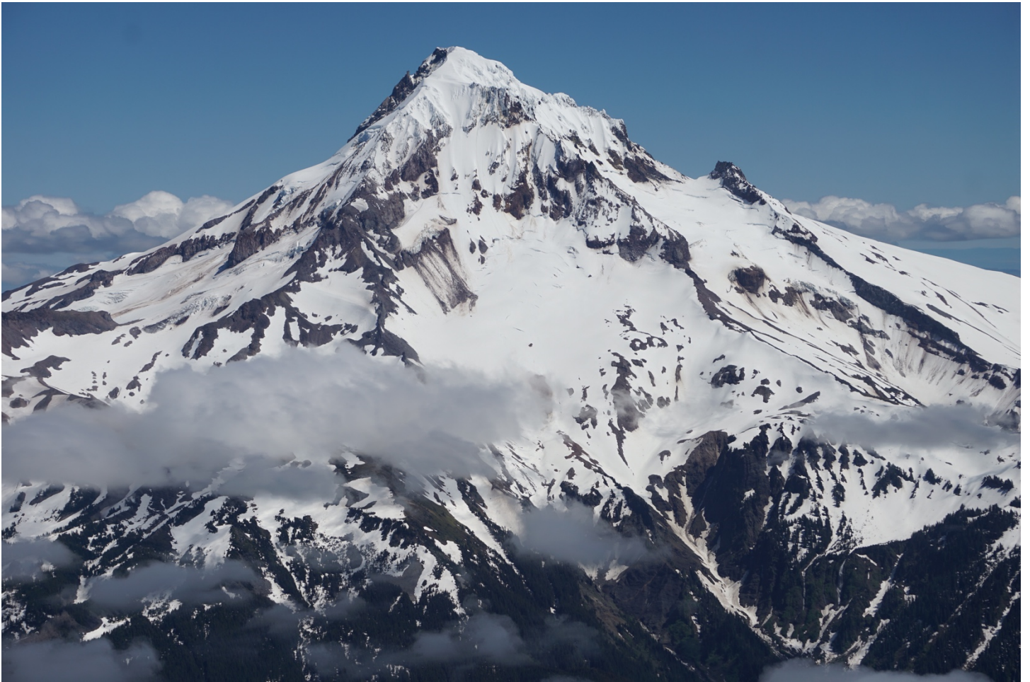
Getting a view of some of Oregon's snowcapped peaks during the transit back to Hillsboro Above: Mt Hood | Below: Distant view of Mt Jefferson (left) with the Sisters visible to the right