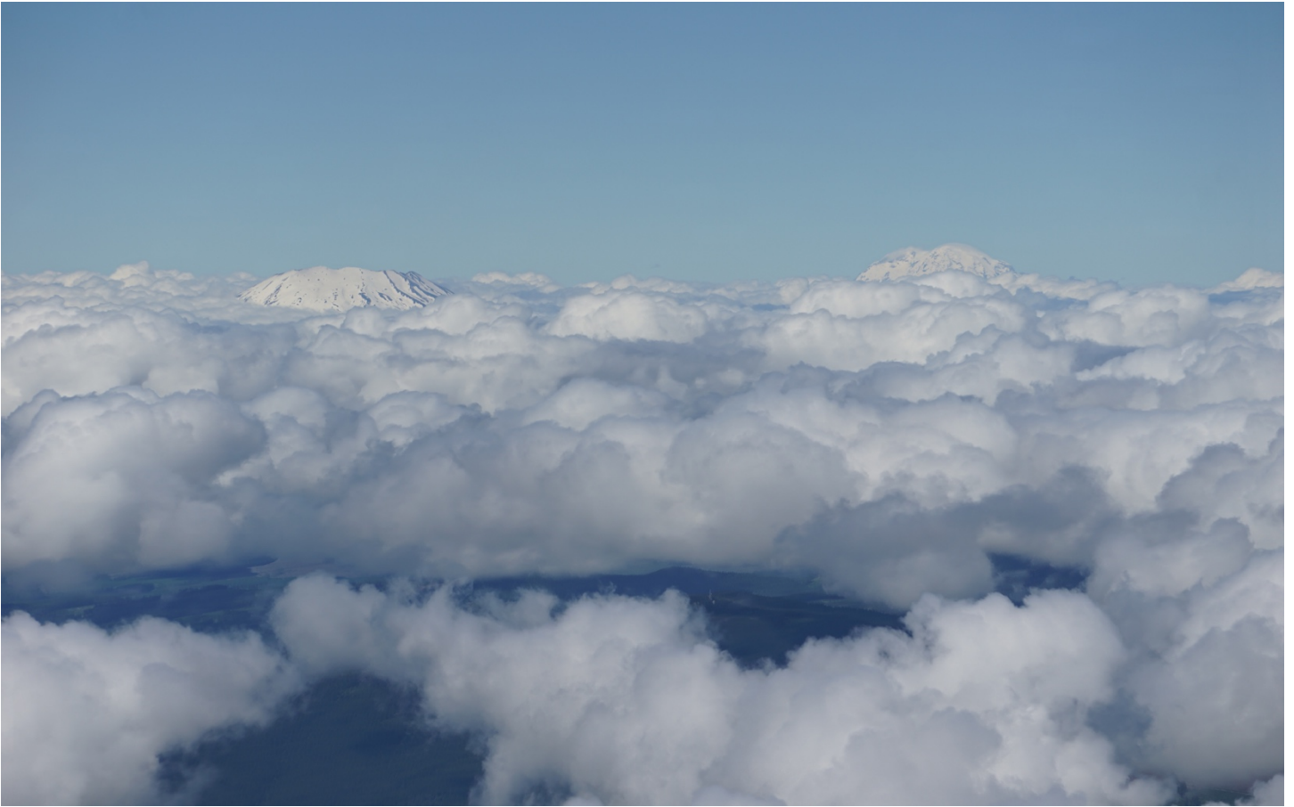
Above: Clouds hovering at flight altitude at ABBY with Mt St Helens (left) and Mt Rainier (right) hiding to the North. Below: Mt Adams from above the WREF flight box, still too cloudy to collect.