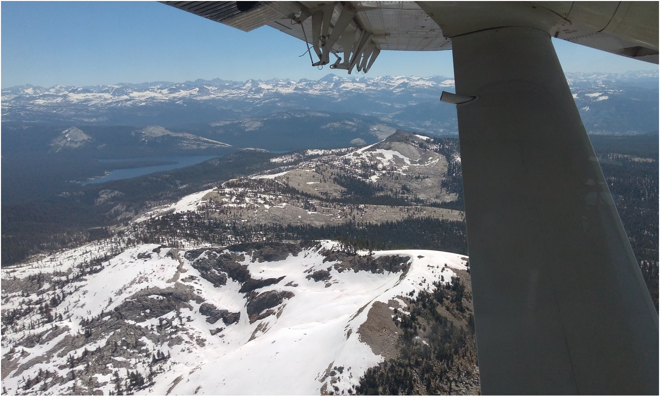
Above and Below: More views of the stunning Sierras from the TEAK collection site.