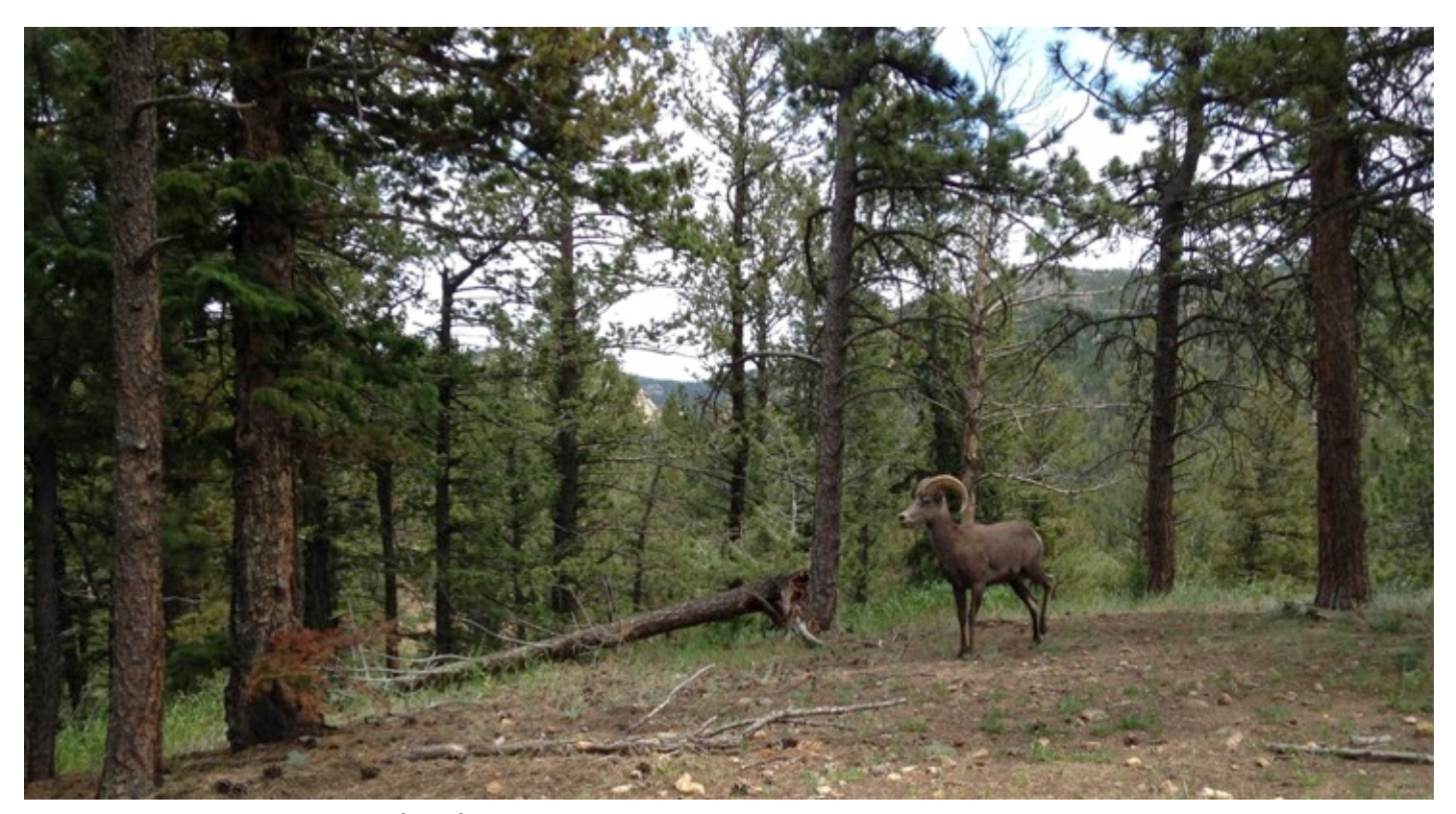
A male (ram) bighorn sheep wanders near the GPS site at RMNP