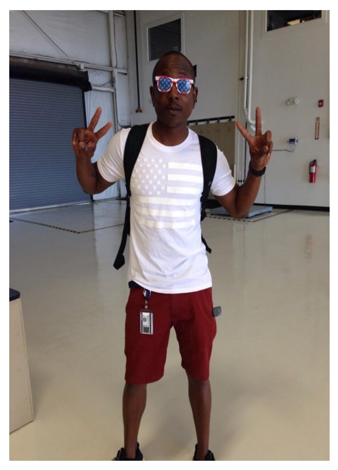
Happy Independence Day Everyone! Be Safe!