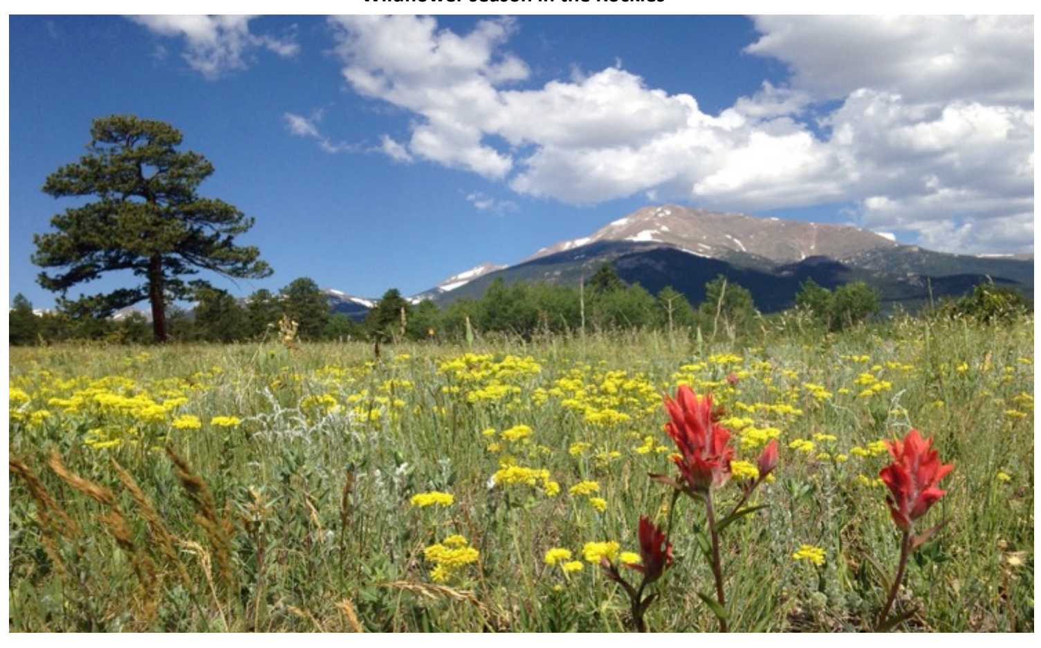
Wildflower season in the Rockies