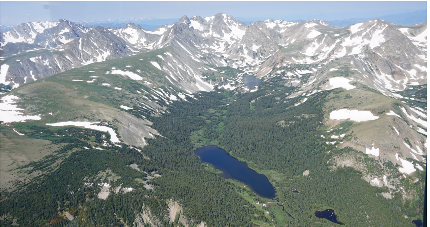
Below: Another view of Indian Peaks, with Long Lake in the foreground