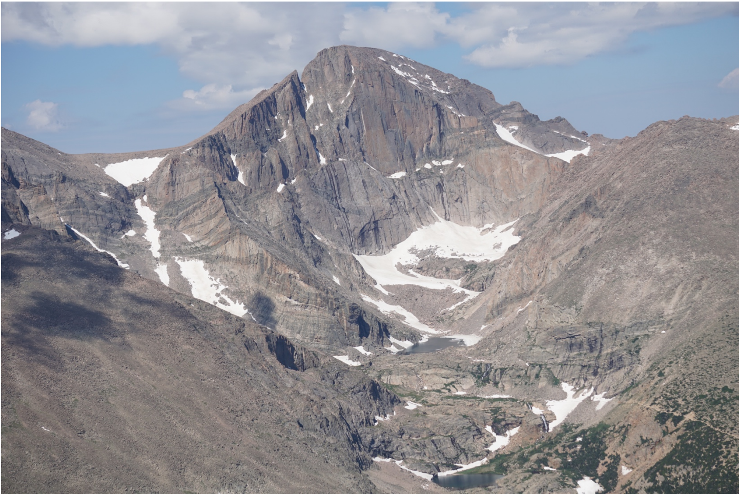
Above: Longs Peak