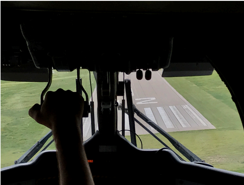
Above - Short final at KGLD, Goodland KS