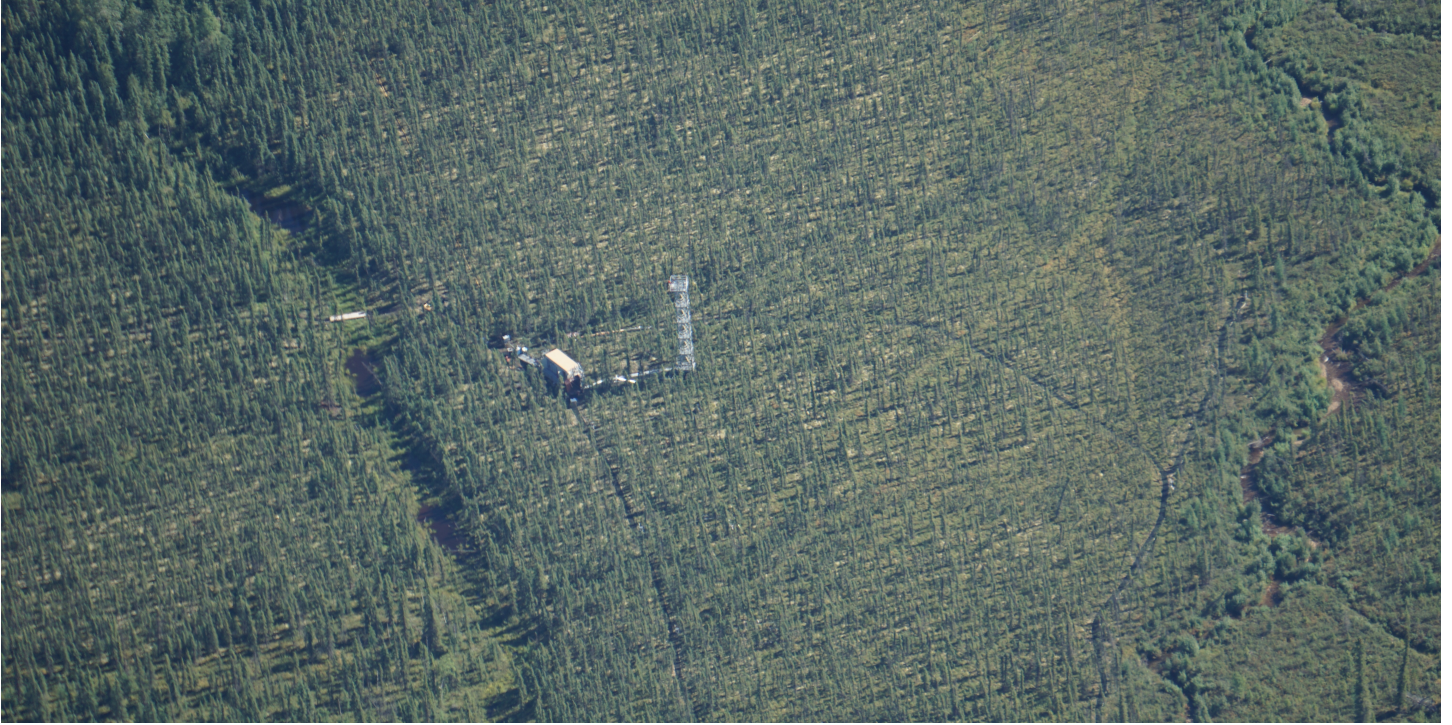
Above: NEON tower at BONA Below: Denali barely visible through the haze.