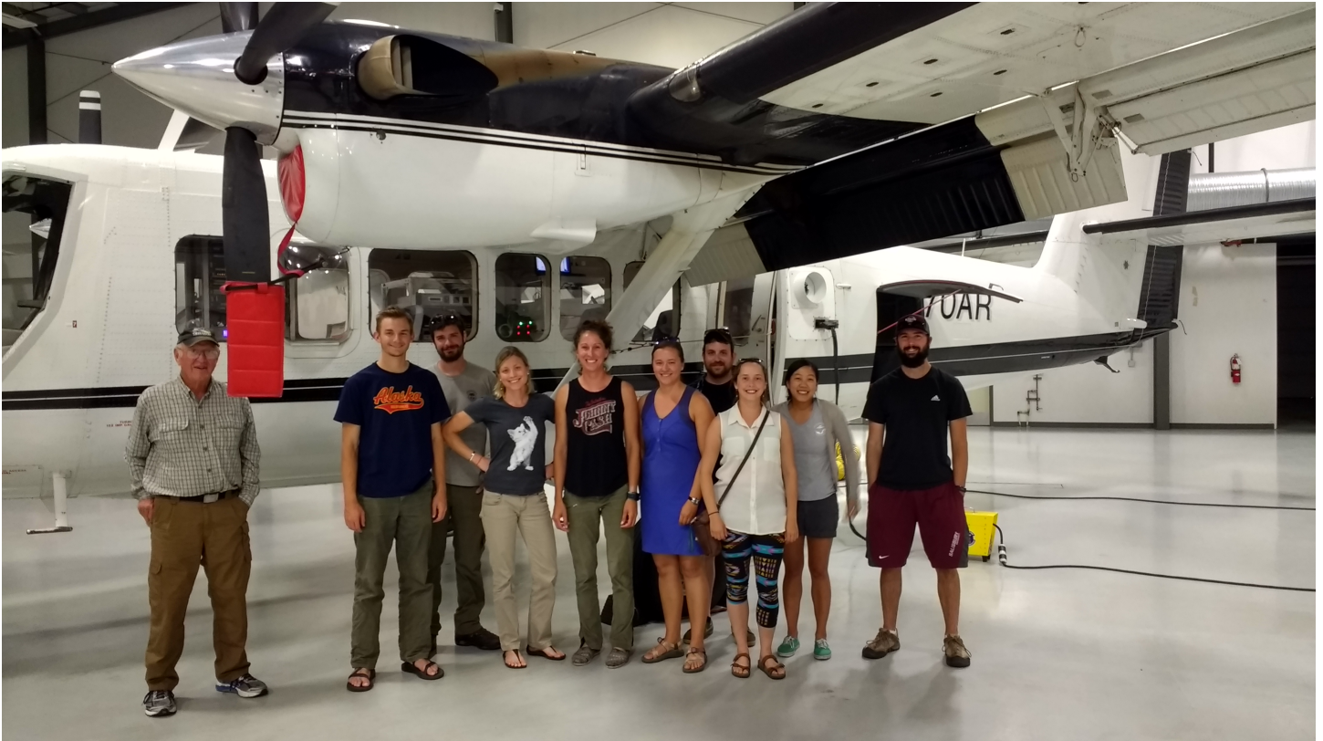
Meet and greet with D18/19 staff!