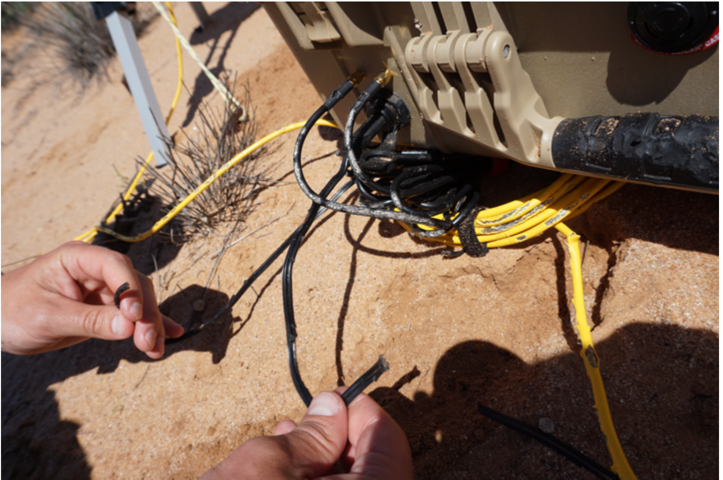
Chewed cables of GPS 13 at Jornada