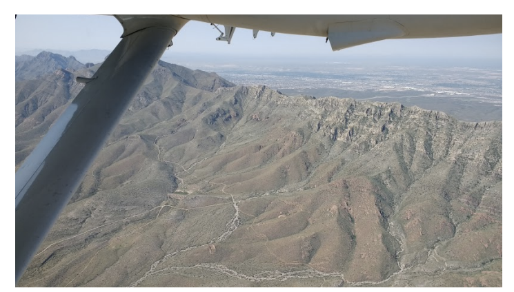
Dramatic scenery on our transit to JORN