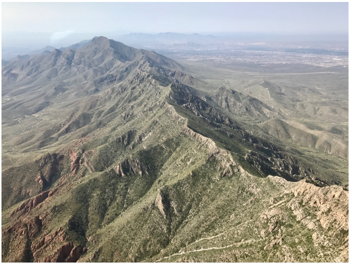
From another angle