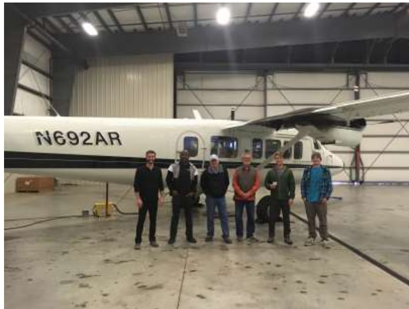
Students Visit the Otter today