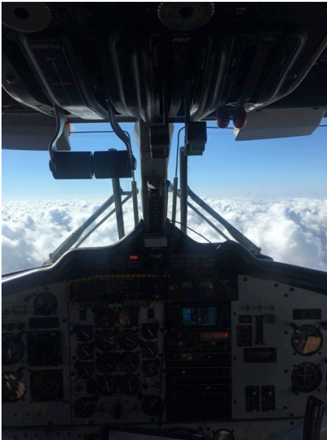
Transiting from D03 KTVI – D03 KISM