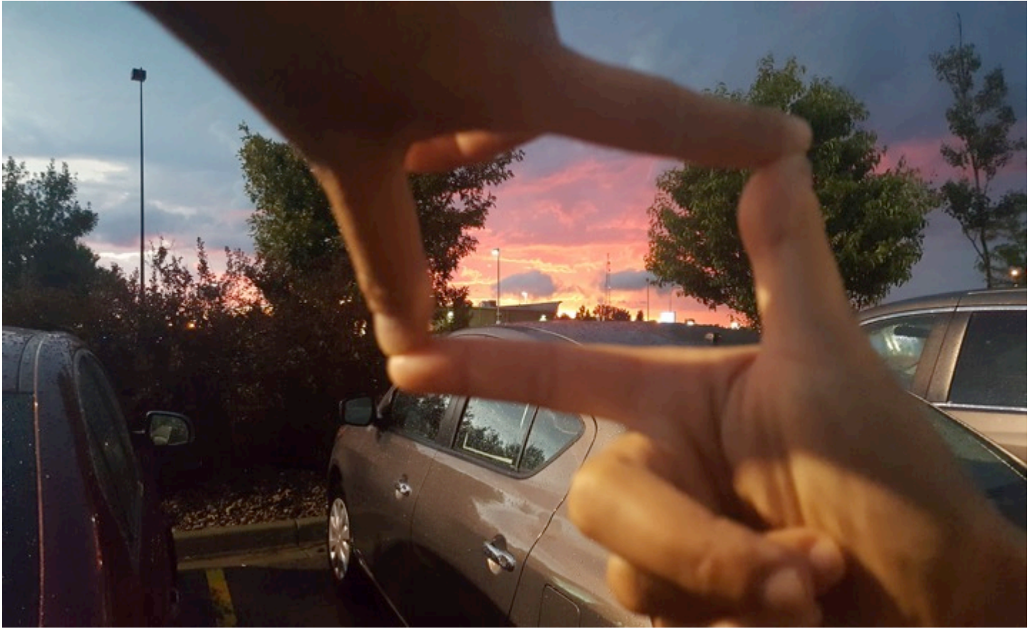
Ivana frames the perfect Sunset in D09