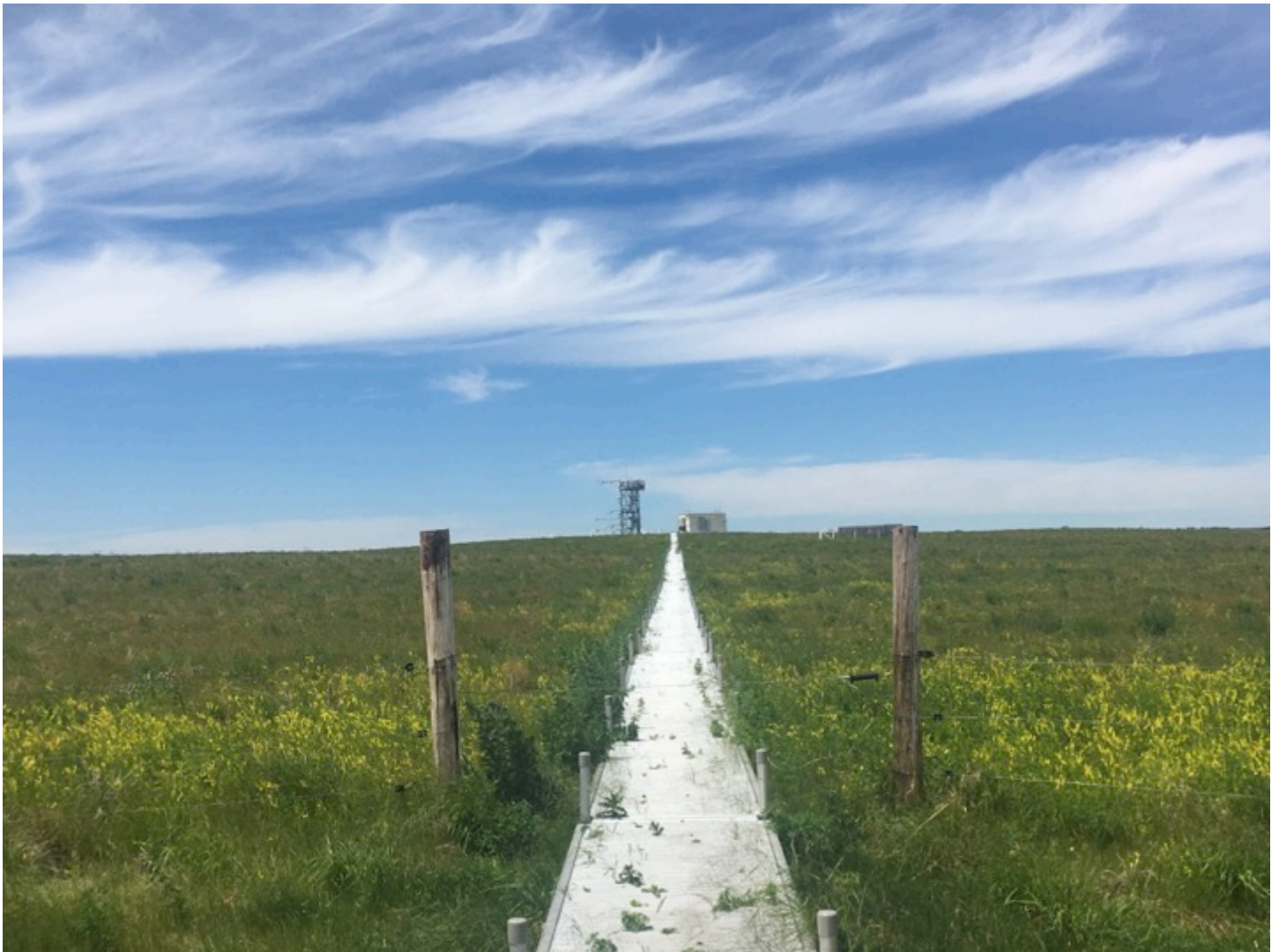
A View of the D09 WOOD Tower in the distance as Ivana and Cameron recover the GPS base-station

Here are a few behind the scenes pictures from the flight season. Enjoy!