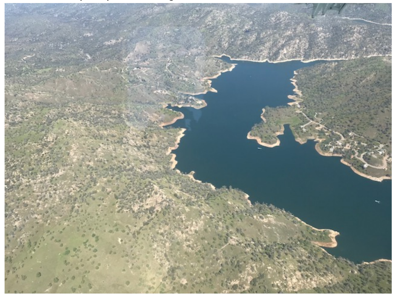
Millerton Lake East of San Joaquin Experimental Range (4/1/2018)