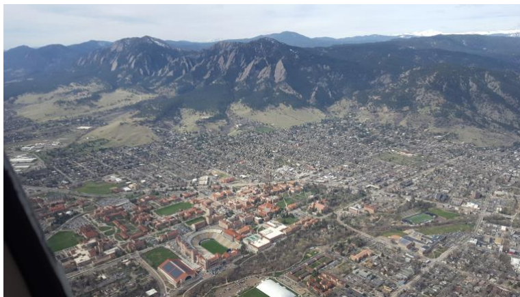
CU's campus with the Flatirons in the background