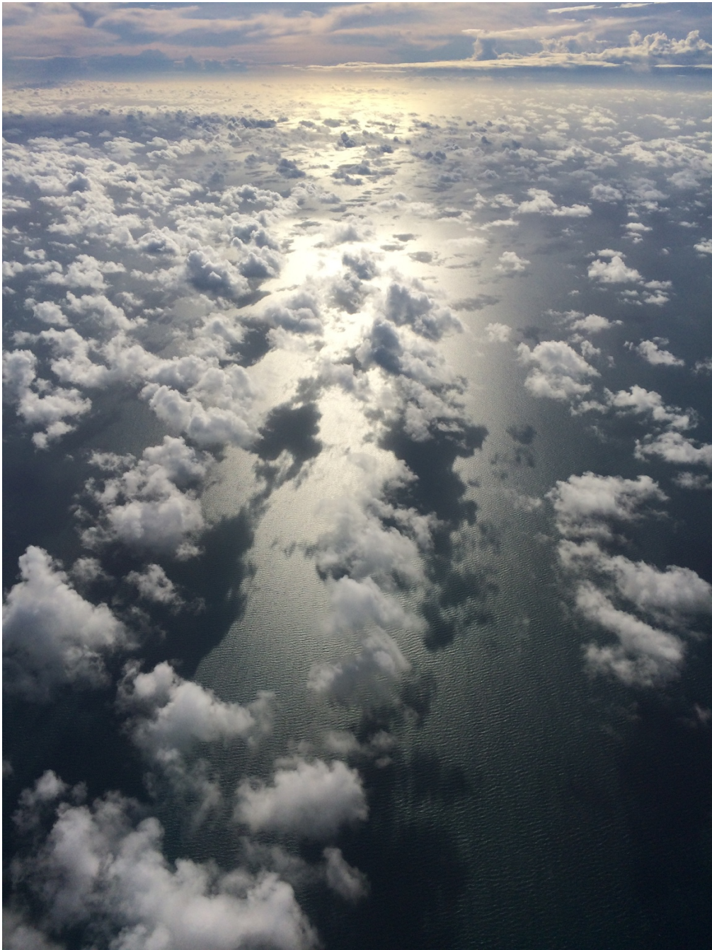
Entering international waters after leaving Florida very early in the morning.