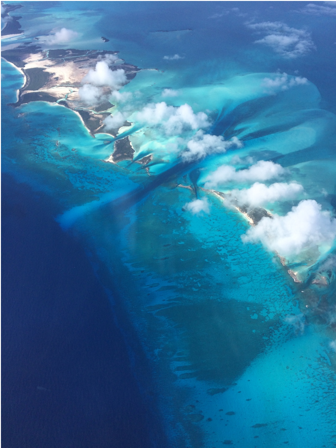
Islands in the Bahamas.