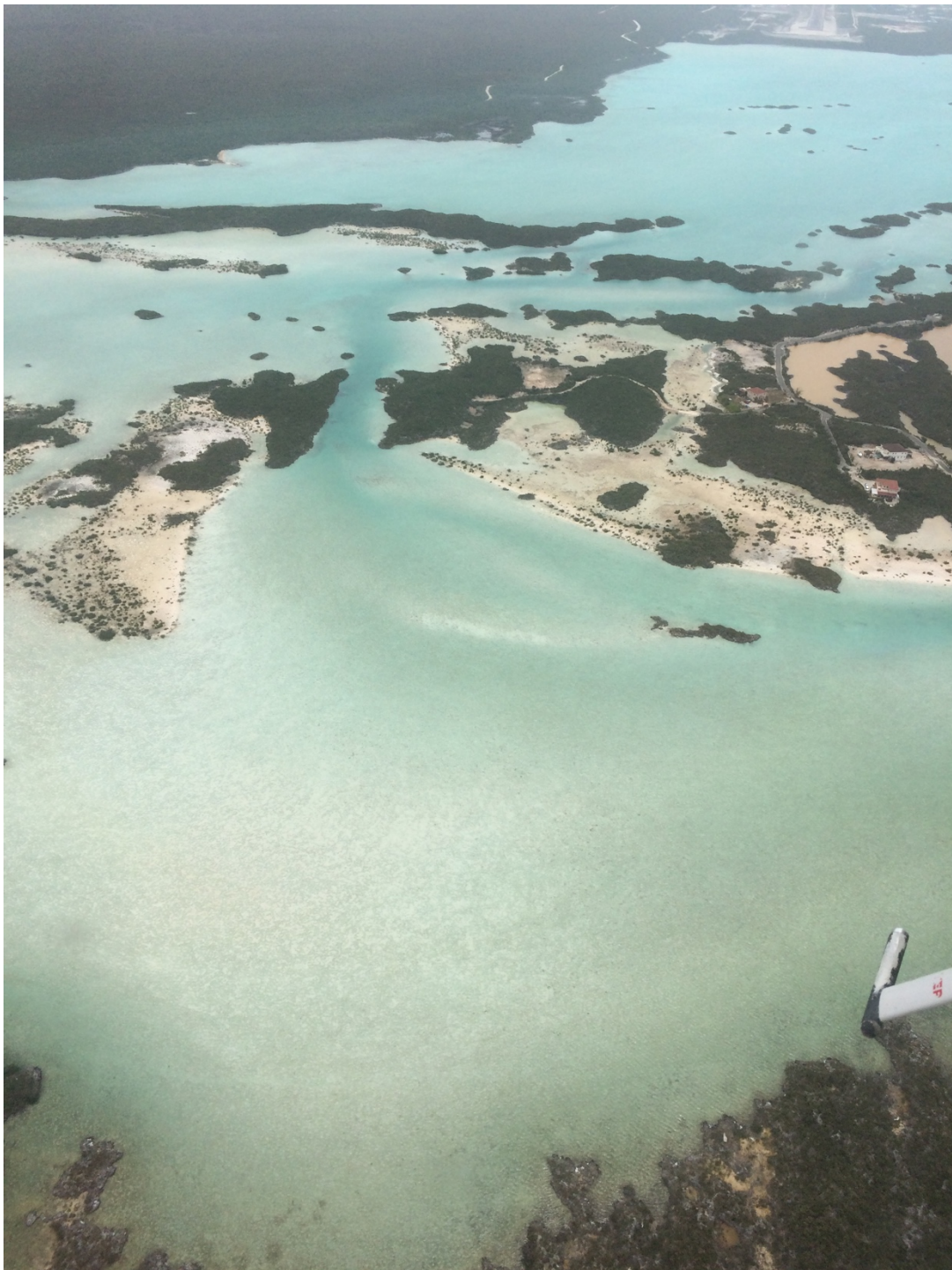
The approach to Providenciales International Airport, Turks and Caicos.