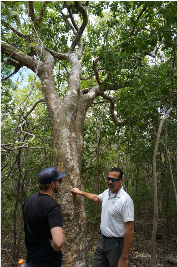
~400 year old Guayacan Tree in Guanica State Forest near the D04 tower site.