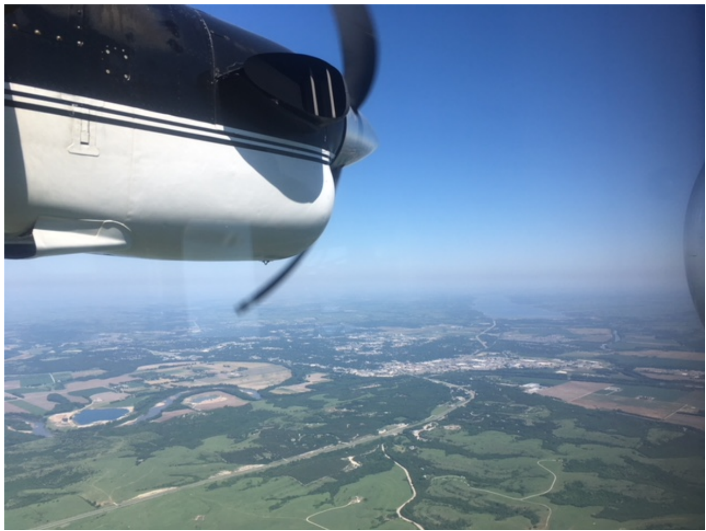
Flying Over KONZ/KONA 20180605