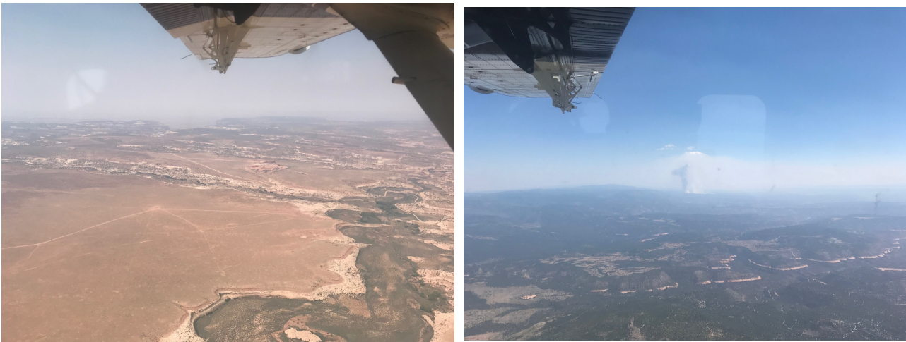
Hazy conditions at MOAB(left), Fires in Western CO to blame (right)