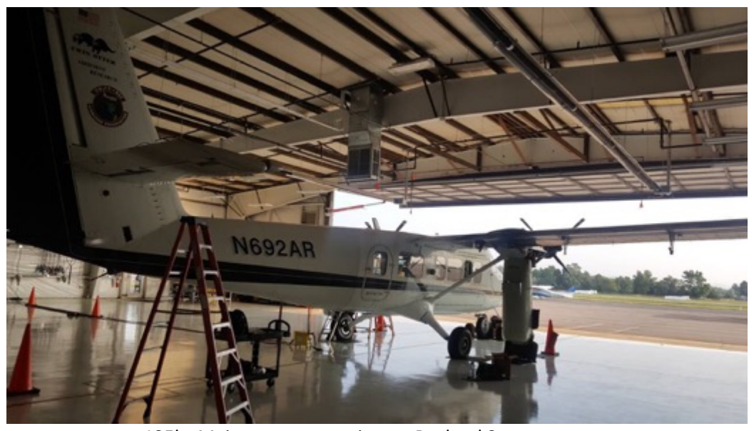
125hr Maintenance ongoing on Payload 3