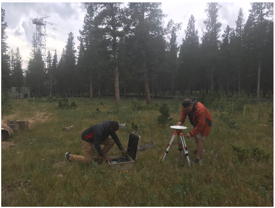
Cameron Chapman and Abe Morrison at RMNP GPS Site (NEON Tower background left)