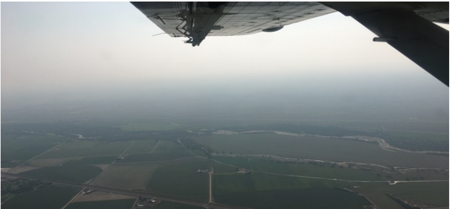
Haze and Smoke observed over Sterling CO