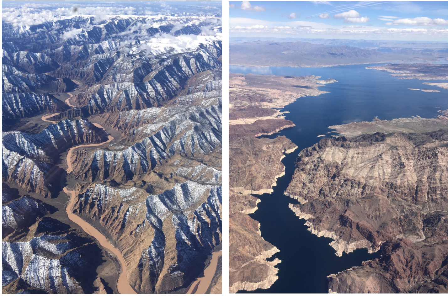
Above left: Desolation Canyon, UT Above right: Lake Mead, NV Below: Central Valley of California