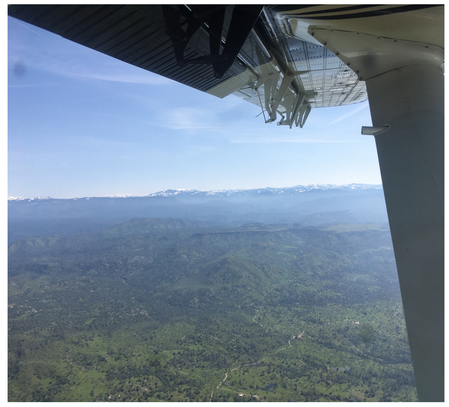
Photos Above and Below were acquired while flying over the San Joaquin Ecological Range today