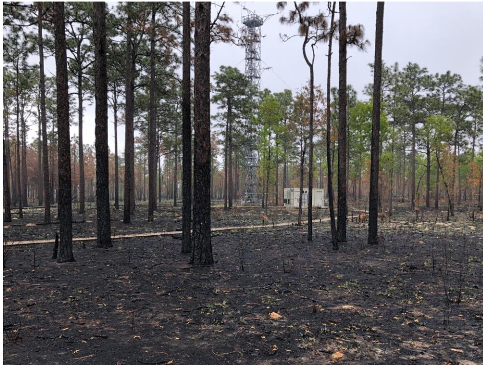
OSBS tower site after controlled burn.