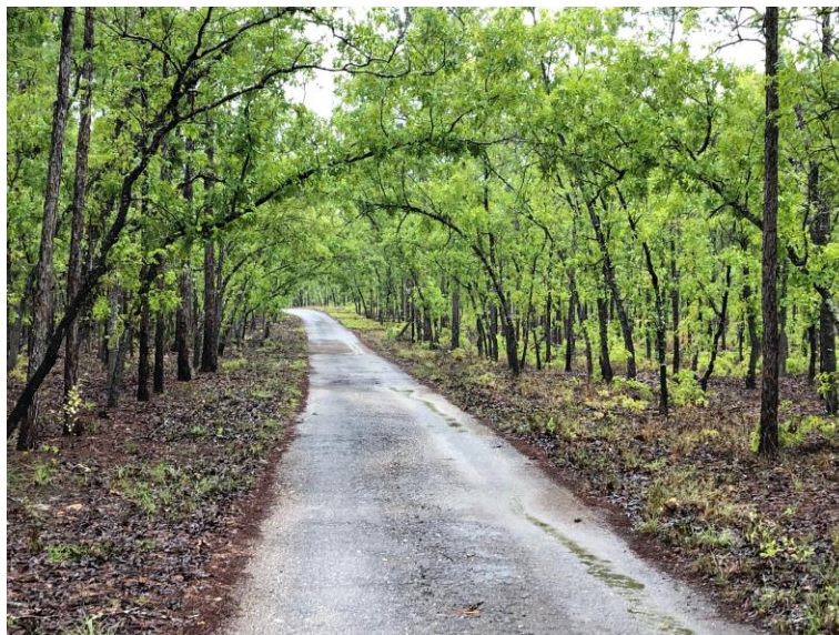
Ordway-Swisher Biological Station (OSBS) on a rainy spring day.