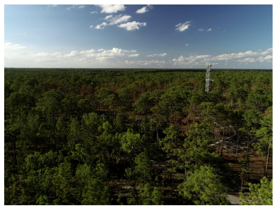
NEON Tower at the Ordway-Swisher Biological Station.