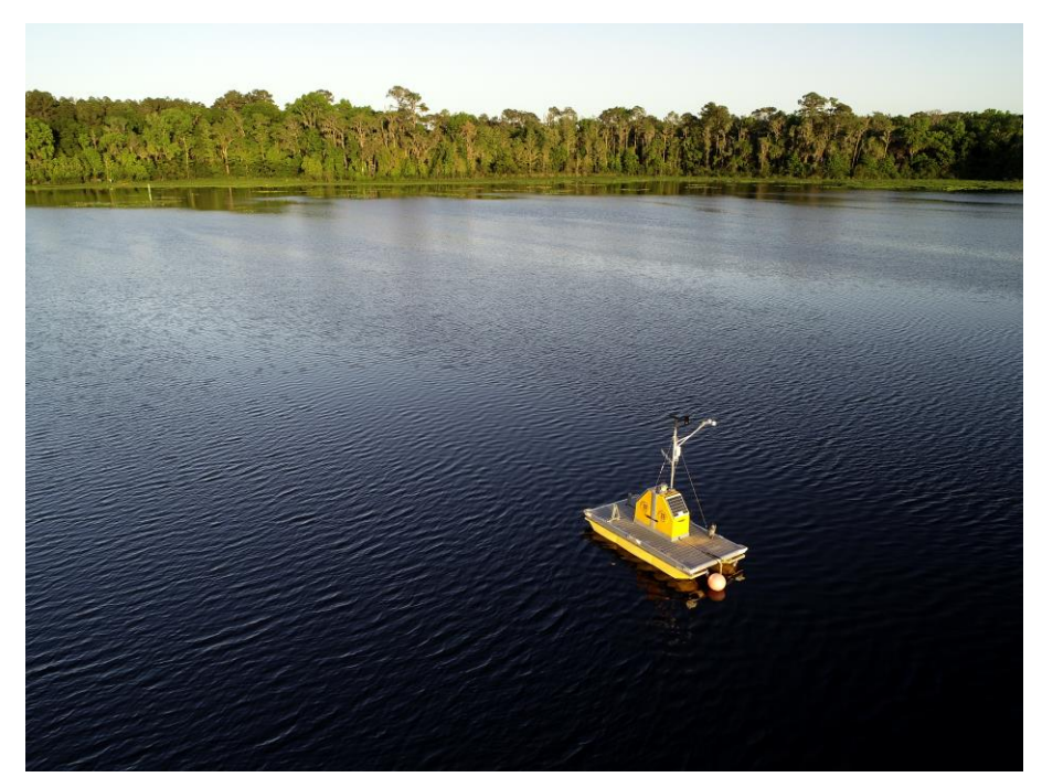
Lake Suggs Buoy at the Ordway-Swisher Biological Station.