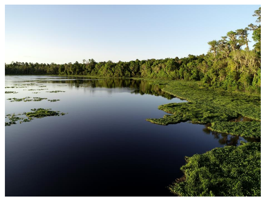
Lake Suggs at the Ordway-Swisher Biological Station.