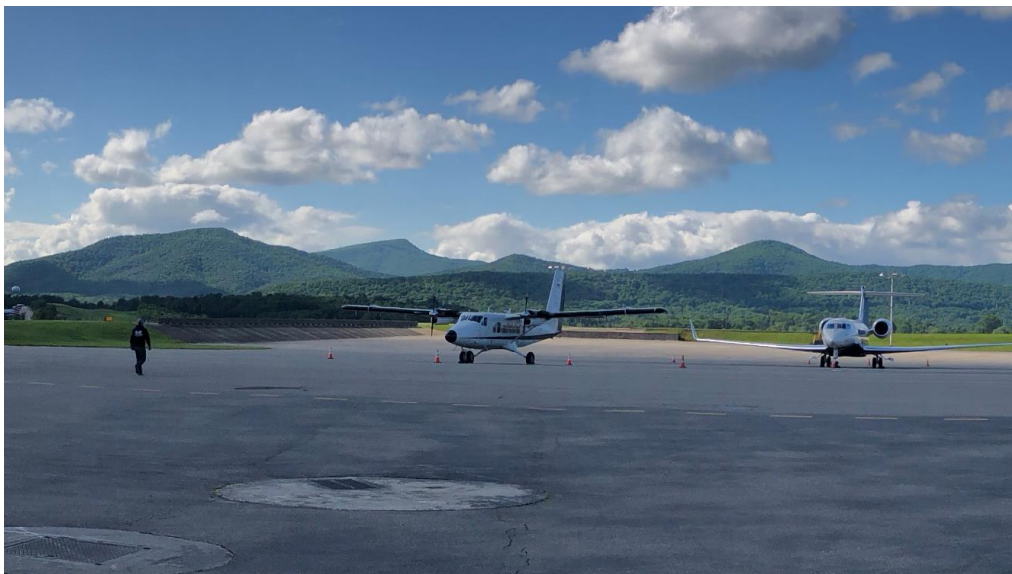
Roanoke-Blacksburg Regional Airport, Virginia.