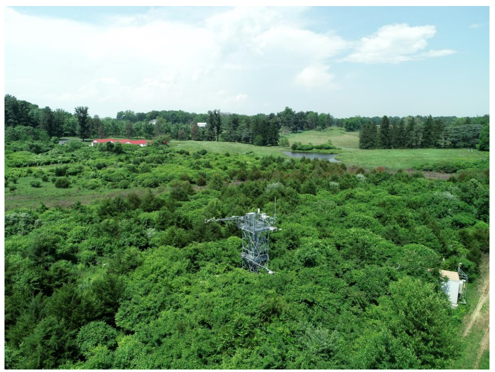
Blandy Experimental Farm tower site.