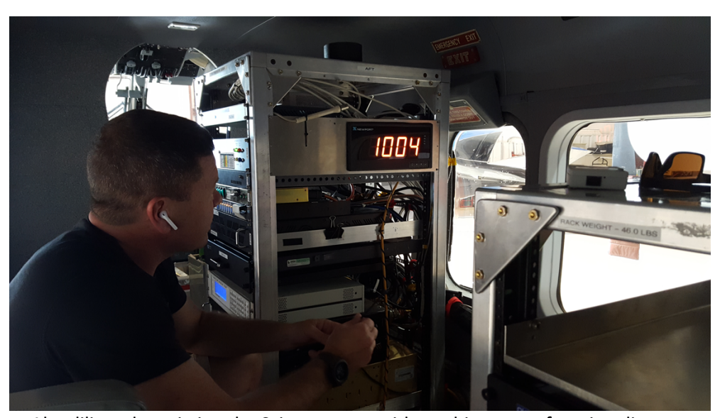
Abe diligently assisting the Science team with a cabin sensor functionality test