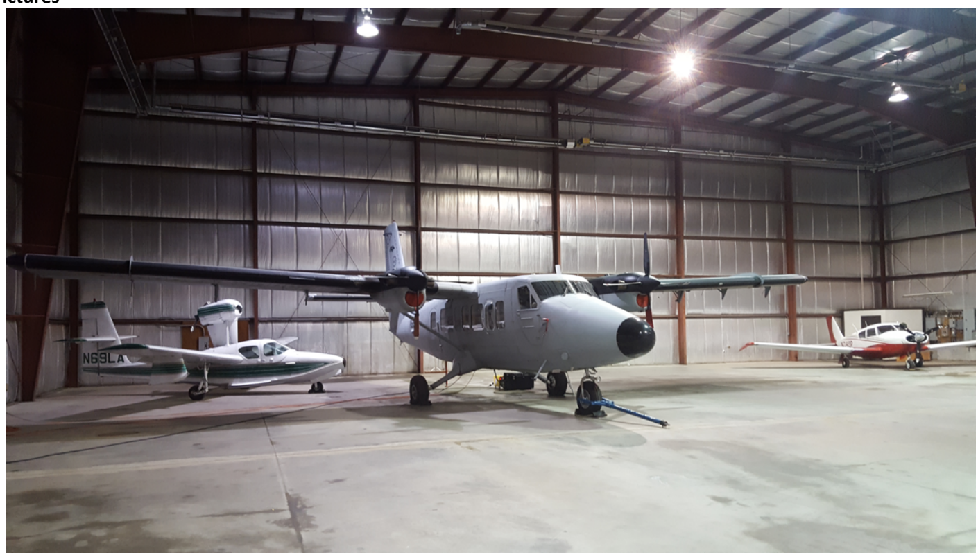
N615AR hanging out with some new pals in D05