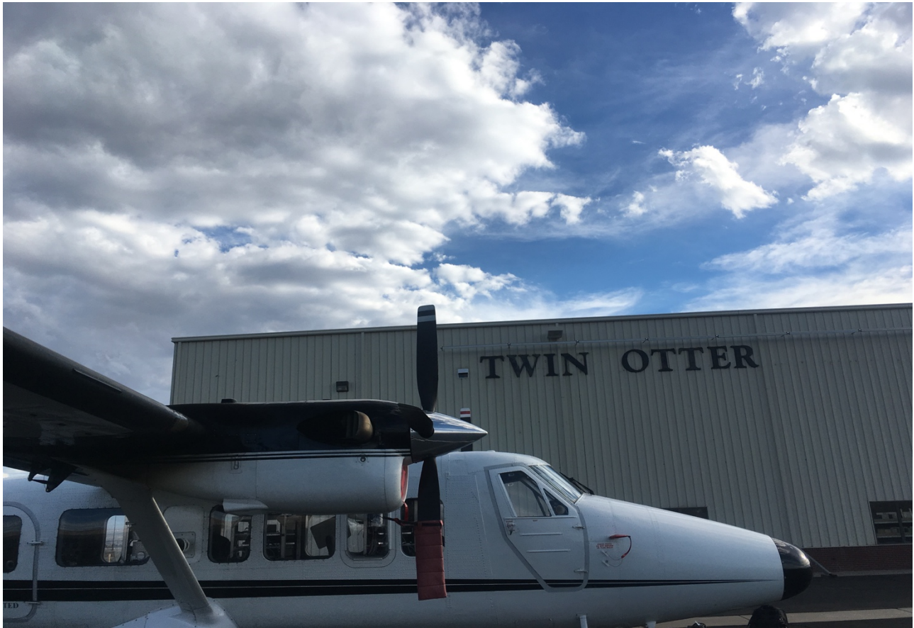
Above: Payload 2 has arrived at Twin Otter for its 125 maintenance