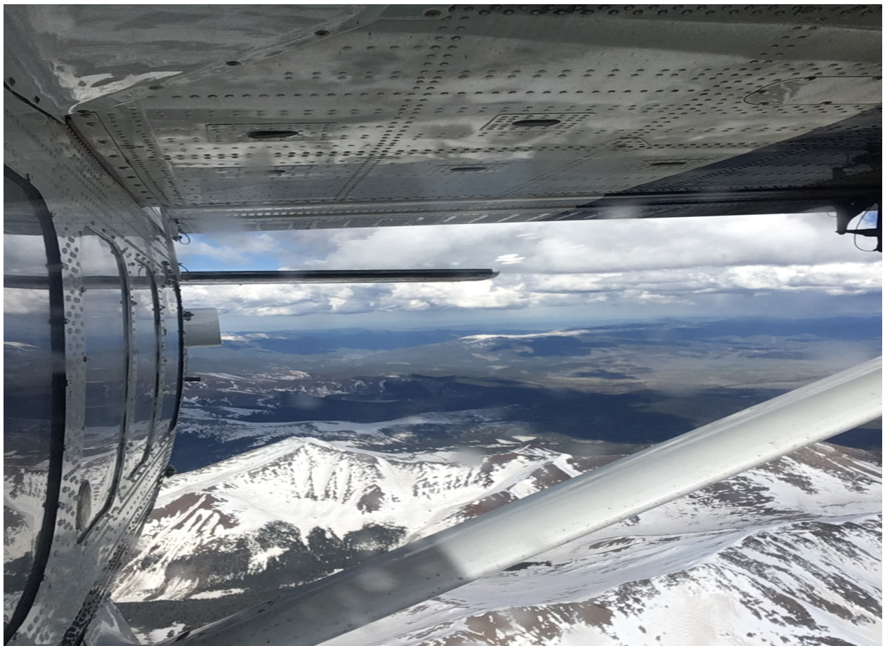
Below: The snow cover peaks of the Rocky Mountains near Breckenridge, Colorado