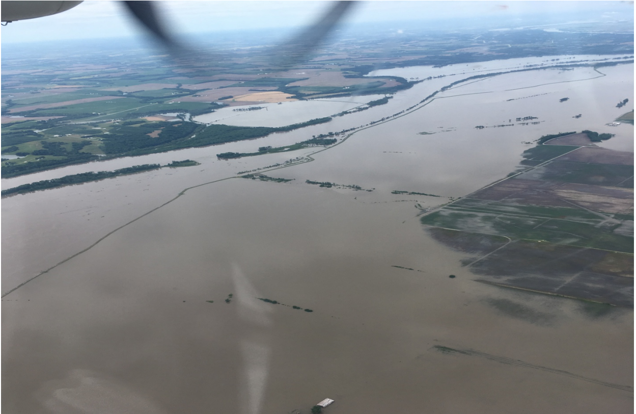
Above: The Missouri River flooding near Norborne, Missouri