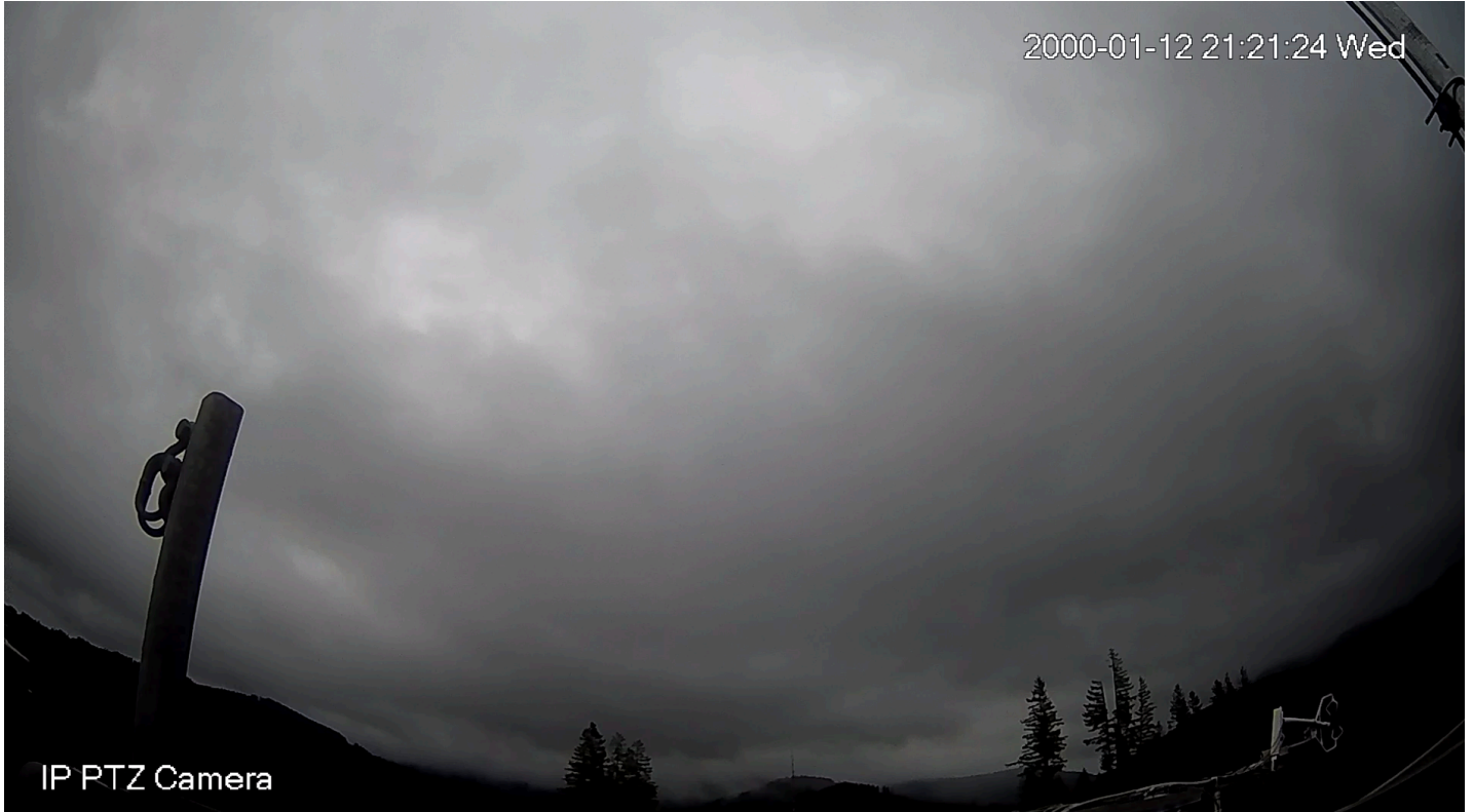
AOP tower camera showing overcast conditions at ABBY site