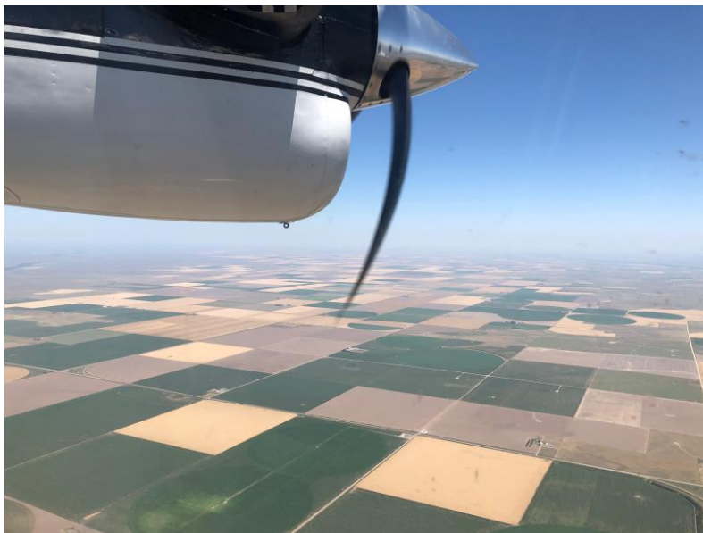
Very flat farm lands over Idalia CO near the CO/KS state line.