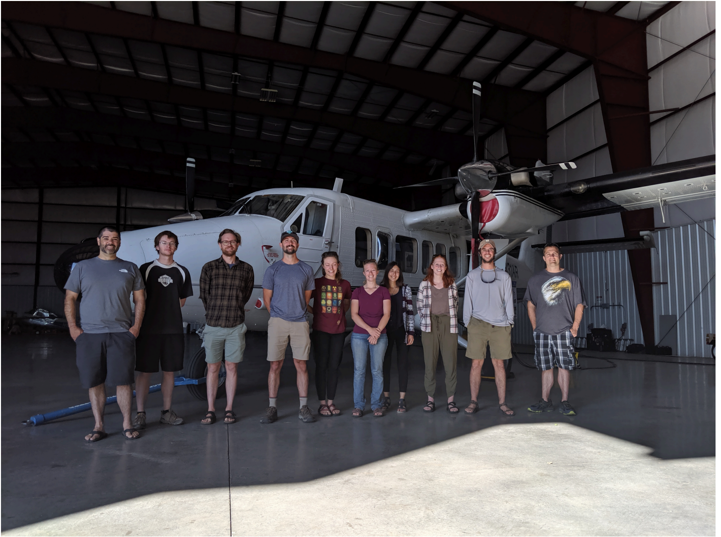
Above: Tour of the AOP with the D12 staff.