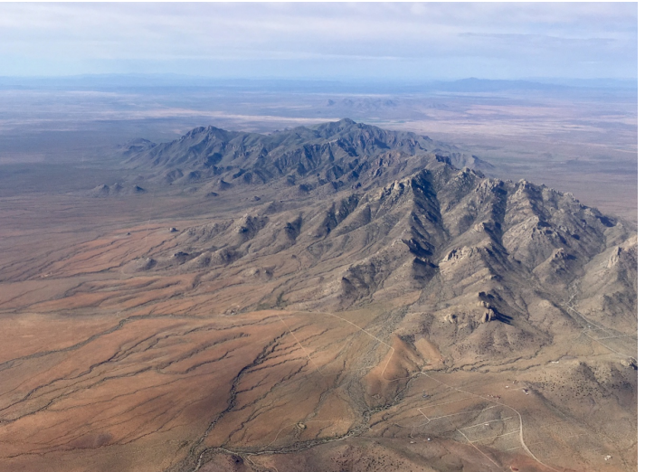
Galiuro Mountains, AZ

Florida Mountains Wilderness Study Area, NM