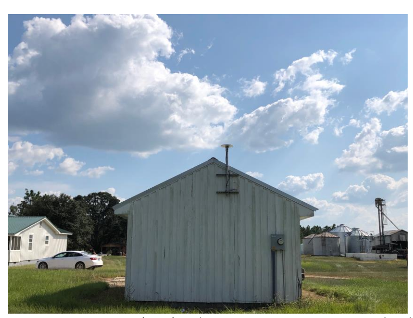
New Permanent GPS station (JERC) at the Jones site in Newton GA.