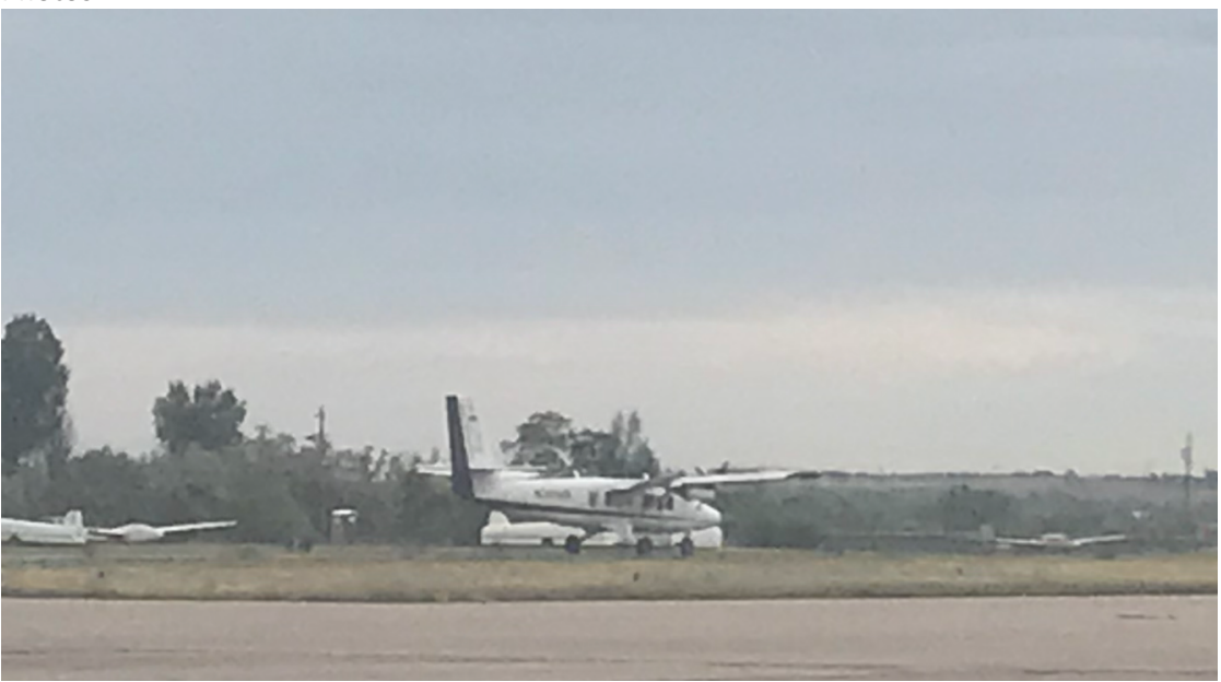
First bird of the season flying home for the winter. (N331AR/Payload 1)