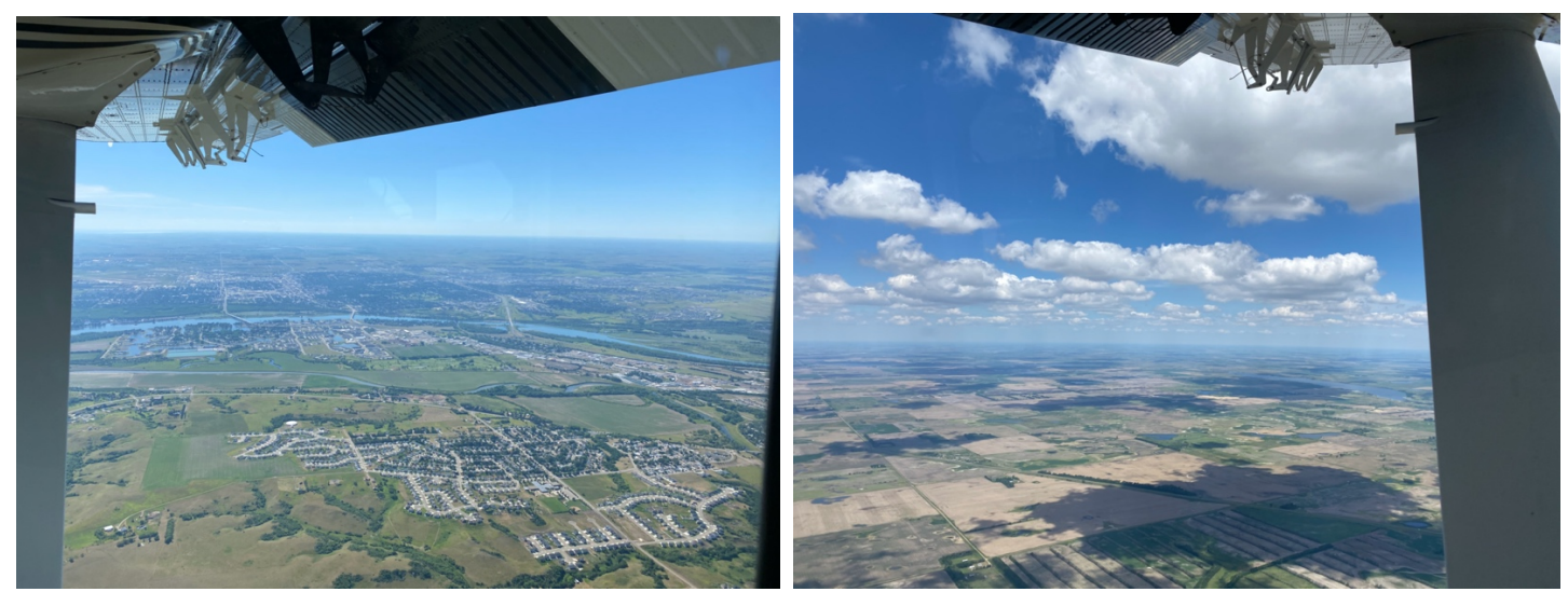
Skies over NOGP at start of flight