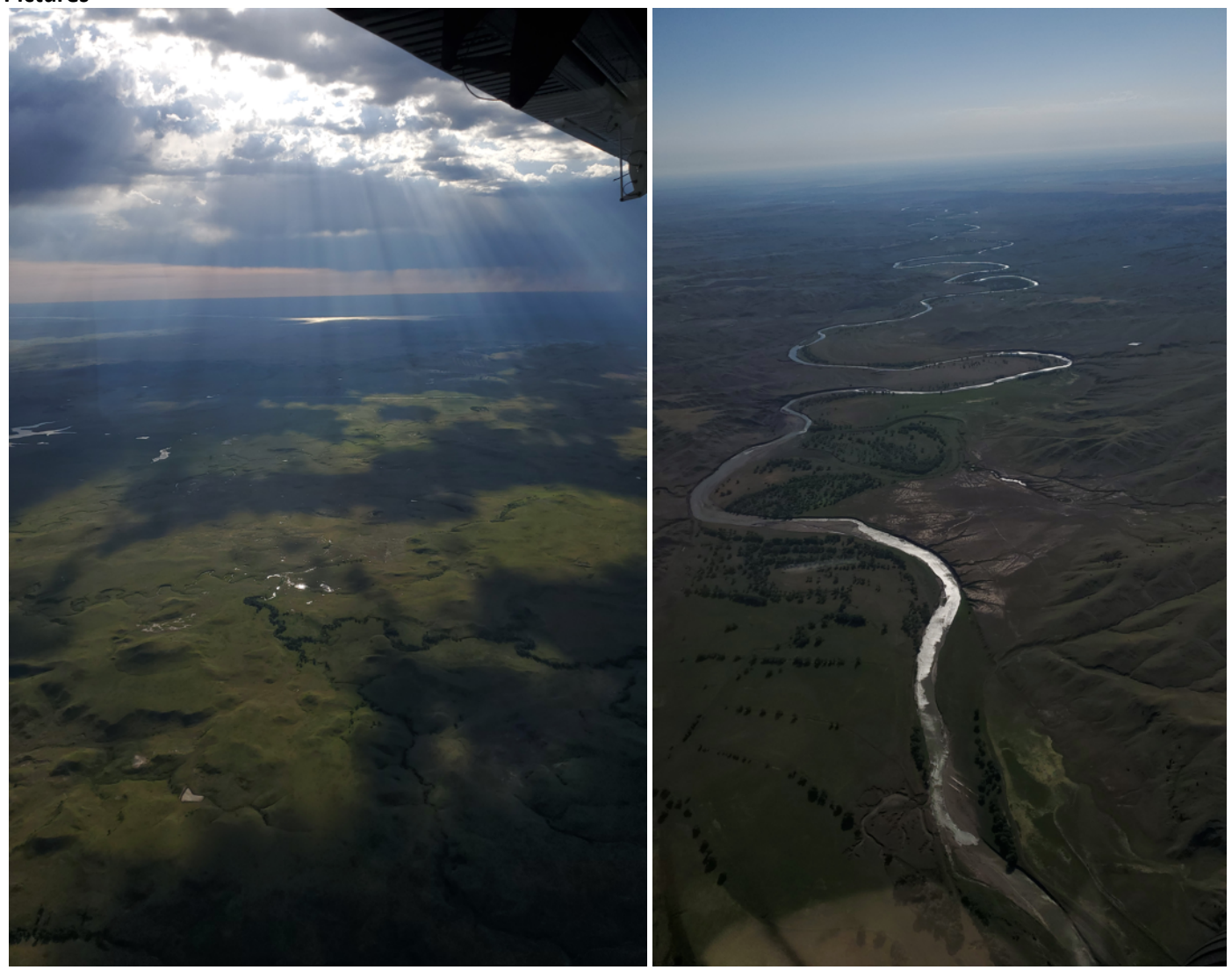
Unknown locations in the vast plains of North and South Dakota