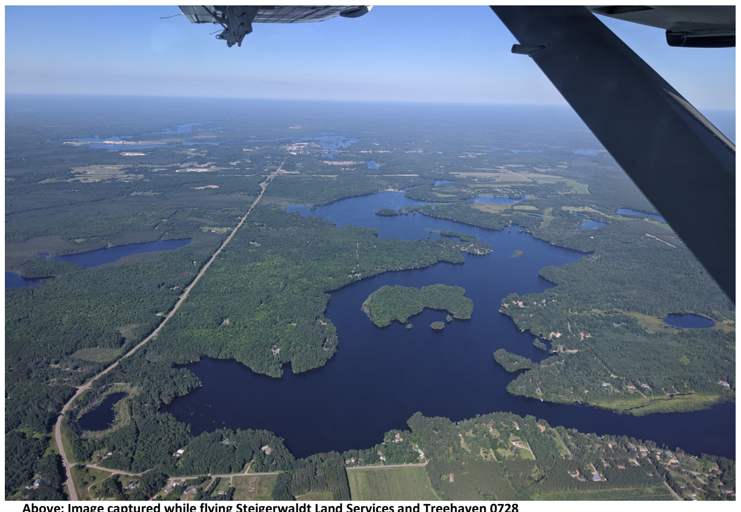
Above: Image captured while flying Steigerwaldt Land Services and Treehaven 0728 Below: The Sky after the flights as observed from KRHI