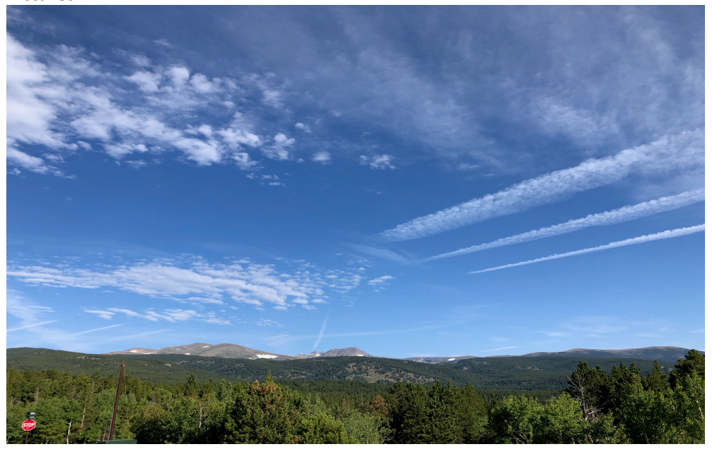
Skies this morning seen from Nederland, CO.