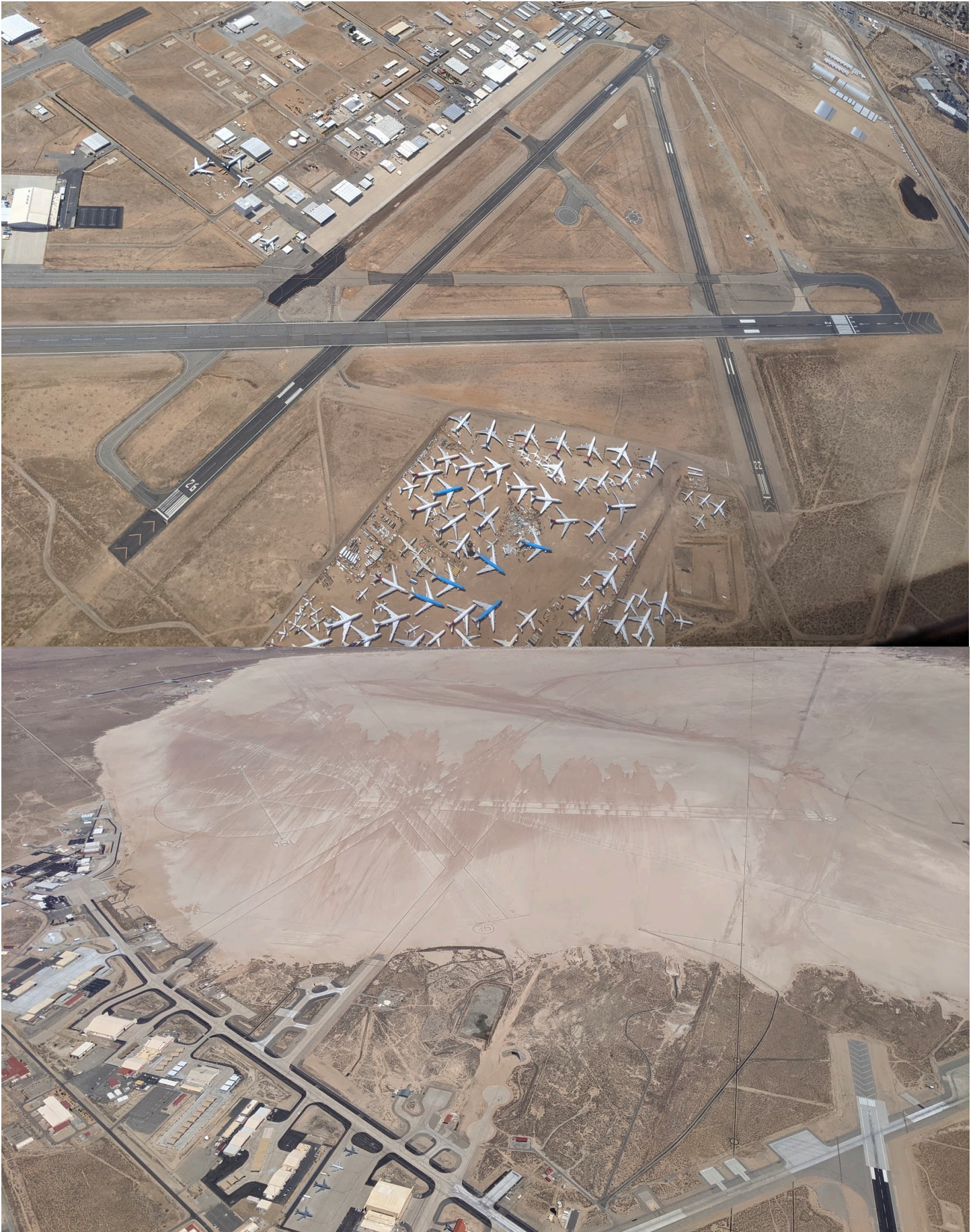
Photos: Flew over some historic aviation areas in SoCal. Mojave Air & Space Port on top, Edwards AFB Base on bottom.