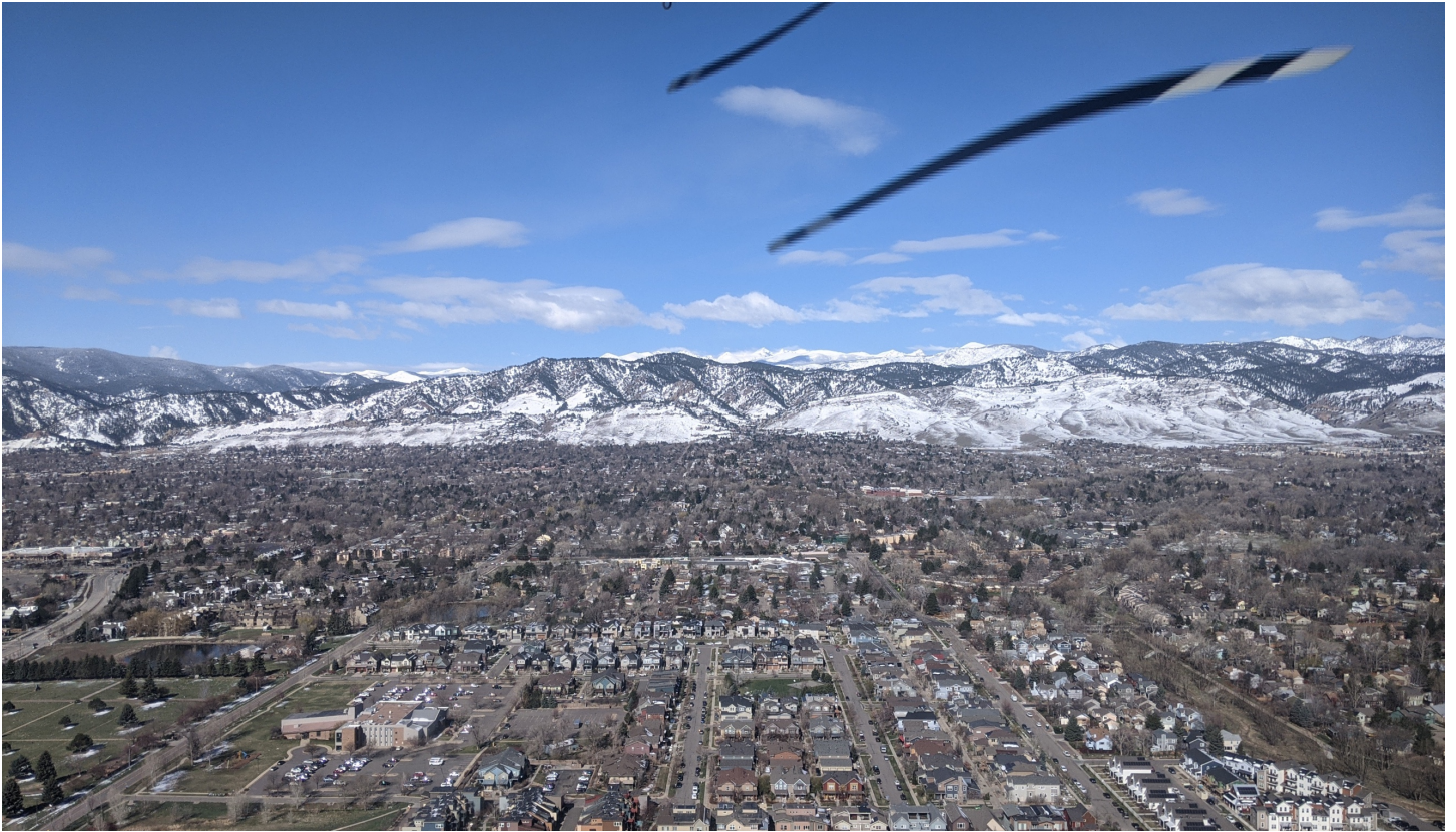
Top: Departing Boulder, CO