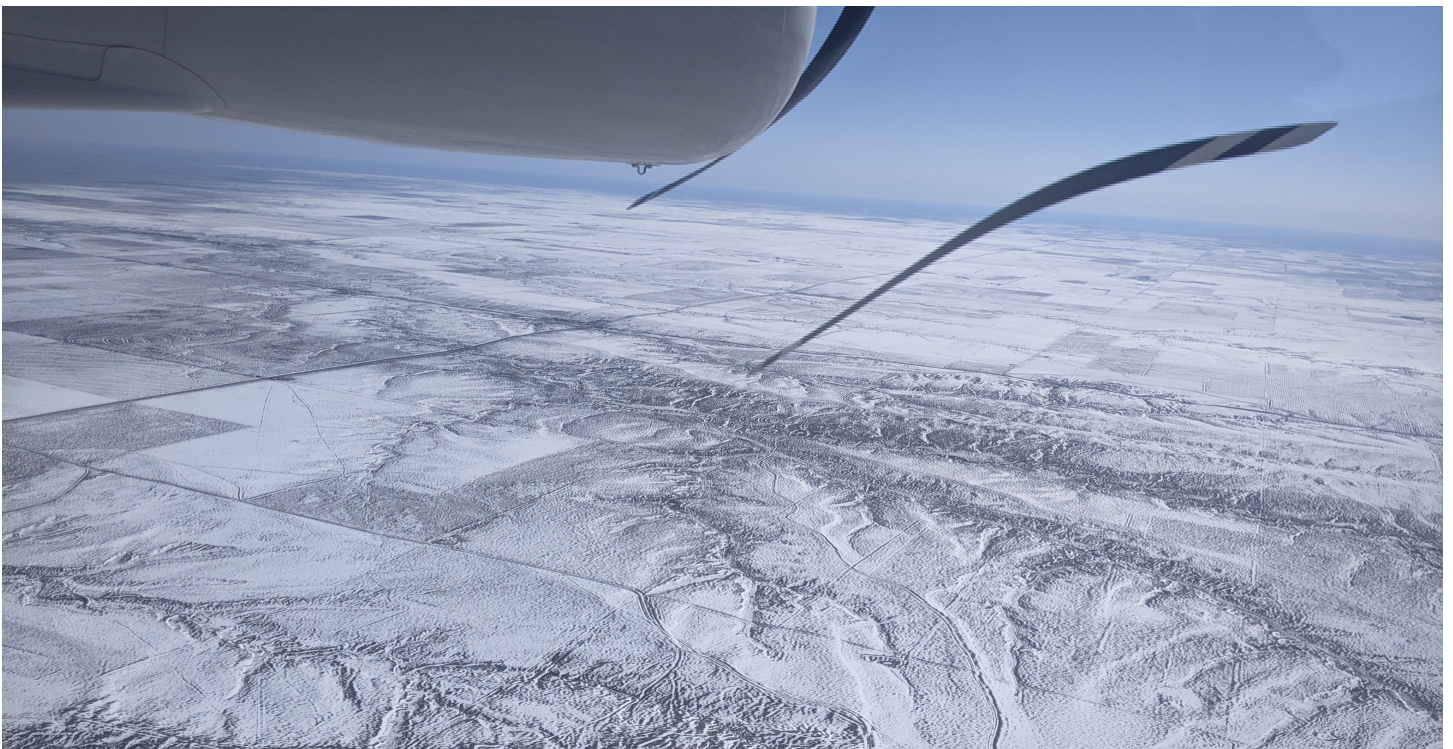
Bottom: The frozen eastern plains of Colorado