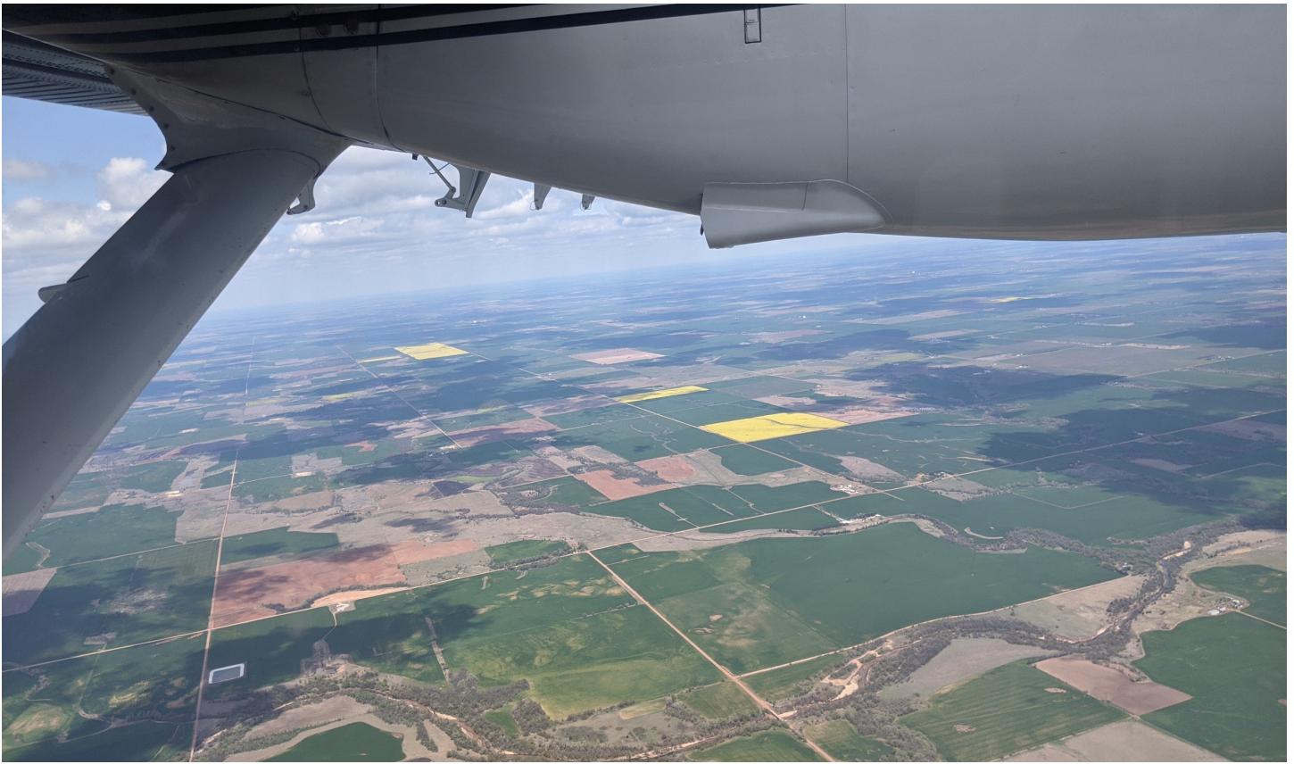
Top: Transiting through Oklahoma/Arkansas