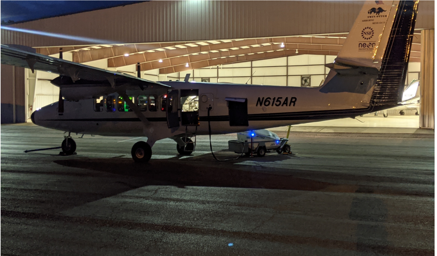
Bottom: Arriving in D08 Tuscaloosa, AL