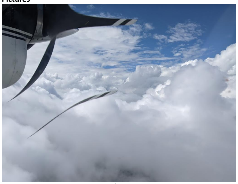
Picturesque clouds on the route from Ocala to Meridian.