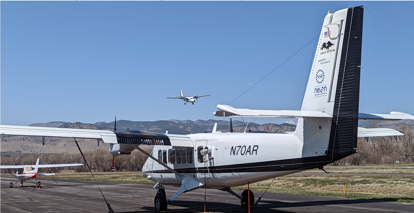
Pictures: N70AR sitting pretty while Payload 1 gets some work in today.

D00|B10E (Riegl Borelight Calibration - 1600m, 1000m, 500m)