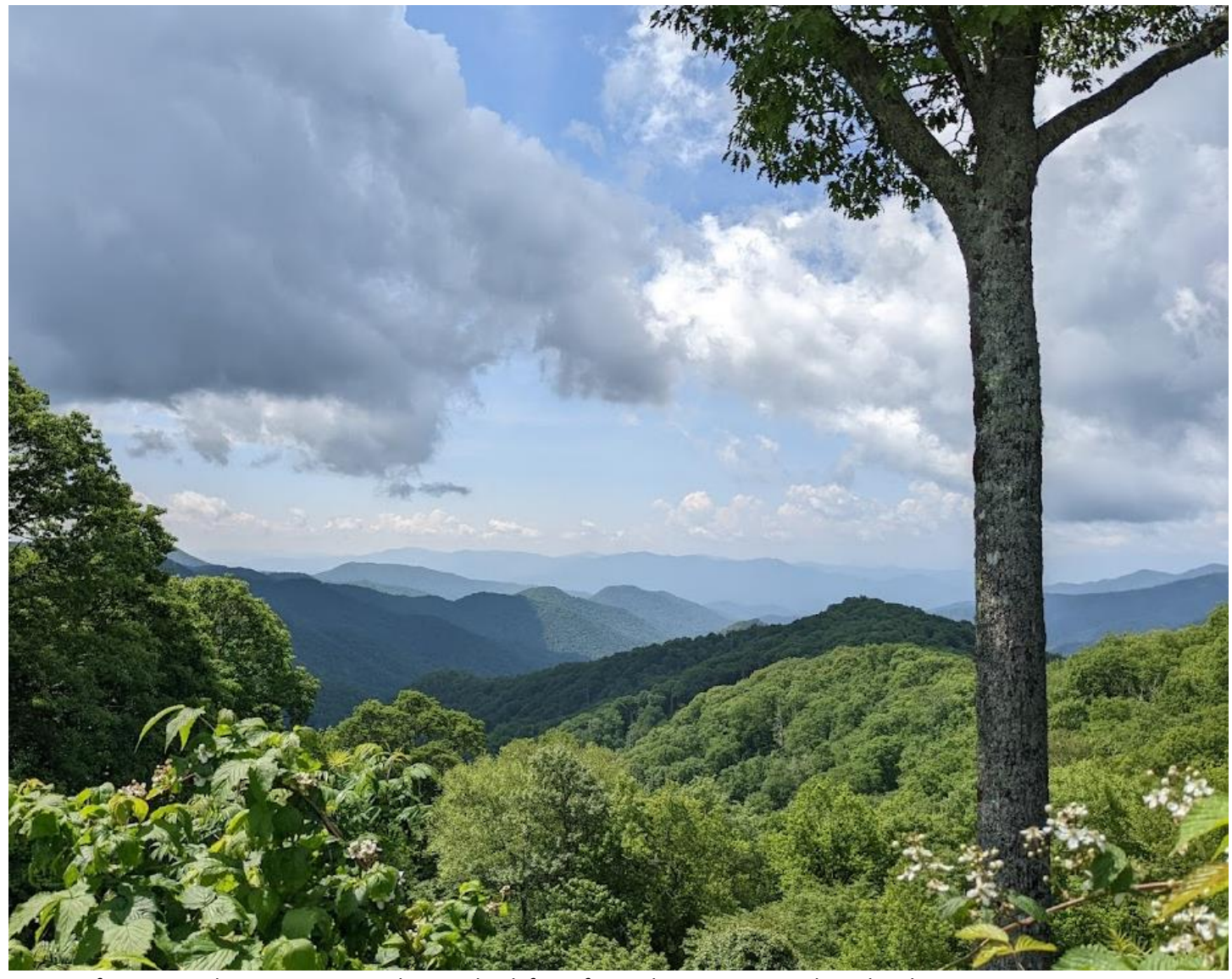
A view of Great Smoky Mountains on the way back from fixing the GRSM GPS.