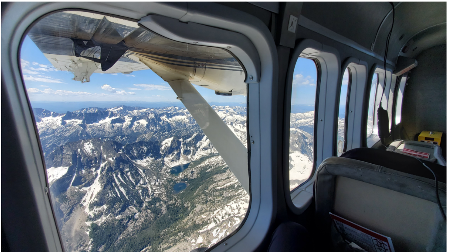
The Otter flies over the Bitterroot Mountains on the border of Idaho and Montana.