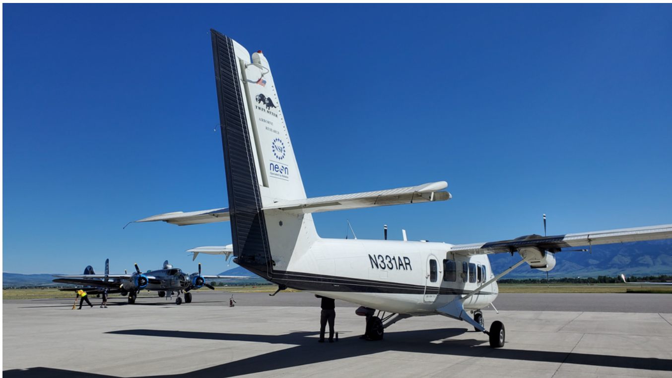
The Otter and the Commemorative Air Force's B-25 exchange glances on the tarmac in Bozeman.