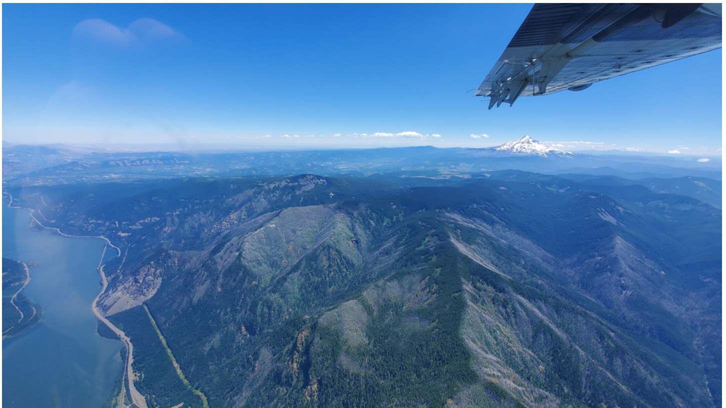
Inbound to Hillsboro with the Columbia River below and Mt. Hood in the distance.