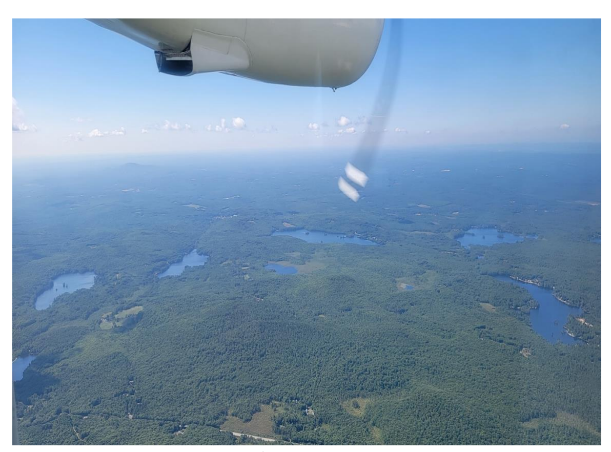
Low cumulus clouds developing below flight altitude at HARV this morning.