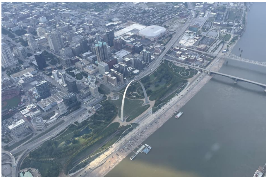
Air traffic control gave us a great tour directly over St. Louis.