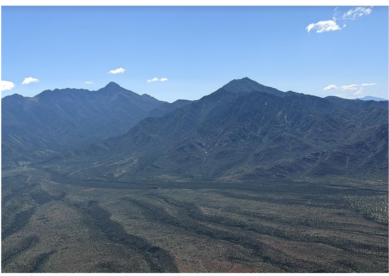
Mt Wrightson and Mt Limon over the SRER site.