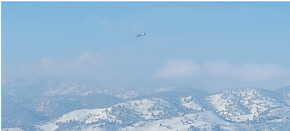
The Otter on approach to snowy Boulder.